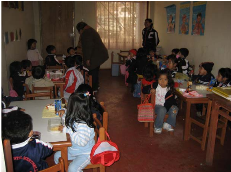
Children from Doscientas Millas nursery took classes in the home of a parent while earthquake repairs were underway

The Westnell Nursery Society was set up in 1986 and registered as a charity to 'advance the education of children below school age in Lima, Peru, by providing safe and stimulating group play and other learning activities.' Westnell comprises two partner organisations: Westnell UK , which is registered as a charity in the UK, and the Sociedad Infantil Westnell , a registered charity in Peru run by nursery staff and community members. The Peruvian charity runs the nursery, organises events and seminars for parents and manages the team of staff. The UK organisation, through its committee of Trustees, exists to further the objectives of the Peruvian society by providing funds and support. It monitors the use of funds raised in the UK through regular reporting by the Peruvian partners and ensures that such funds are used effectively in achieving the objectives of the charity. It communicates with UK members through regular newsletters and other mailings.